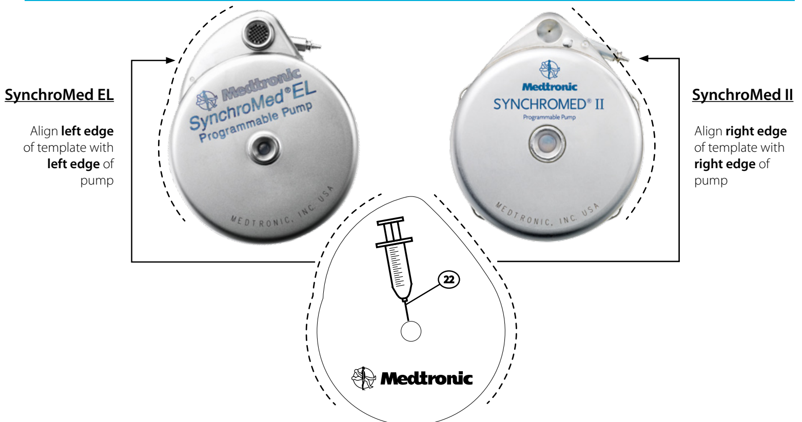
Figure 1. Aligning the refill template correctly for each pump model

Refill Template – The clear plastic refill template is used as a guide for inserting the needle into the refill port of the SynchroMed EL and SynchroMed II pumps. The left edge of the template has the same shape and contour as the left edge of the SynchroMed EL pump. The right edge of the template has the same shape and contour as the right edge of the SynchroMed II pump. When the edge of the template is aligned correctly with the edge of the pump, the circular opening in the center of the template will be located above the pump's refill port.