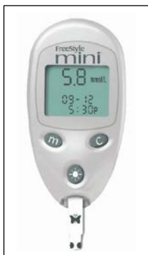
FreeStyle Mini® Blood Glucose Meter