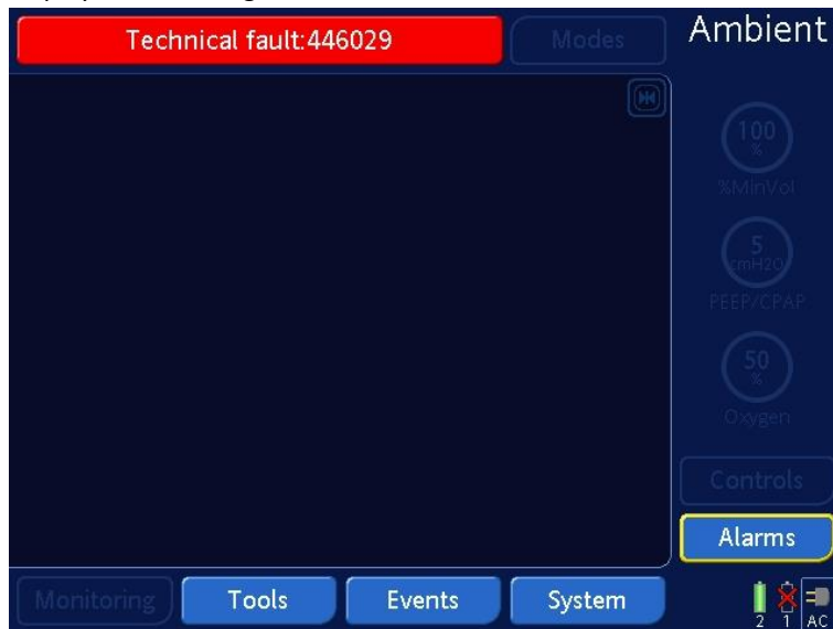
Figure 1: The display indicates “Ambient State”, and a red message with a Technical Fault number (example, a different Technical Fault number might be displayed)

During the “Ambient State” the ventilator will alarm audibly and visually and display the following on the screen: