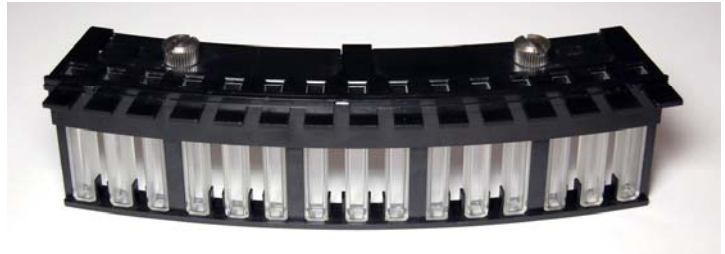
c8000 cuvette segment