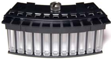
c4000 cuvette segment

The following pictures show examples of normal, undamaged cuvette segments: