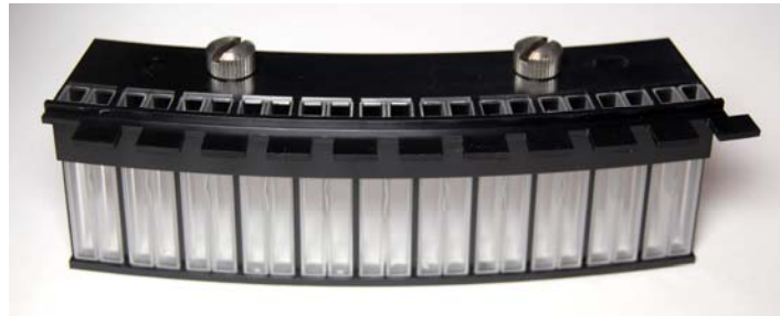
c16000 cuvette segment

The following pictures show examples of cuvette segments where the base is detached from the vertical support post.