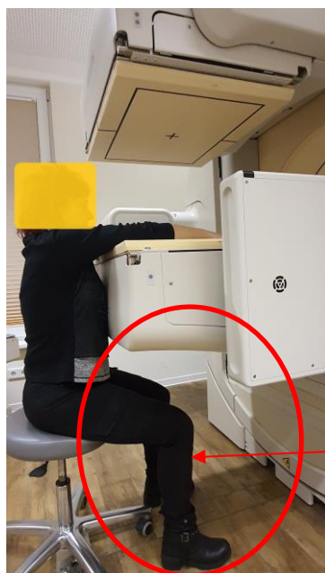
Figure 3. Avoid positioning a patient's lower limbs under the detector below Center of Gantry

Do not position a patient's lower limbs under the lower detector