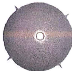
Mallory shell without the apical plug

As a result there is potential for implantation of the Mallory shell without the apical plug or for a minimal delay in surgery whilst a replacement plug is sourced from another Mallory shell or as an individual product. Without an apical plug the Mallory shell will no longer provide a complete solid barrier to any wear particle migration.