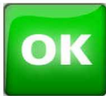
Figure 1: OK icon

Do not use beam authorization by ExacTrac via ADI as a safety feature to ensure correct patient positioning before treatment.