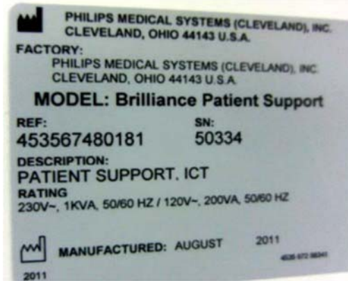
Figure2 (Example: five digit serial number):

The following CT couch six digit serial number ranges are affected: