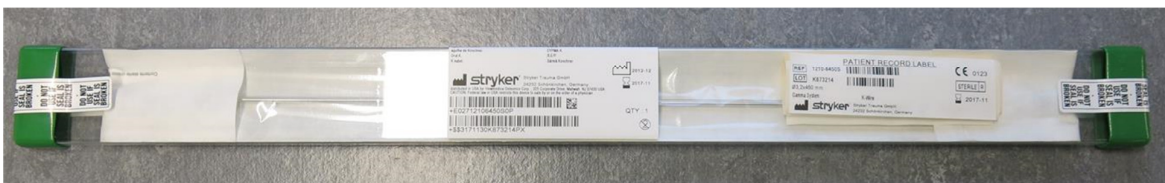
Packaging example – sterile pouch inside (plastic) clear tube

It was found through a review of packaging that the seal integrity of the pouch may be decreased. Stryker Trauma GmbH, Division Trauma and Extremities is recalling all unconsumed, non-expired lots of the listed article numbers detailed on pages 3-7 of this document. Given the high turnover for this product and the frequency with which it had been on backorder it is not expected that a significant quantity of units subject to this notice remain in the field. No injury or harm has been reported for this event.