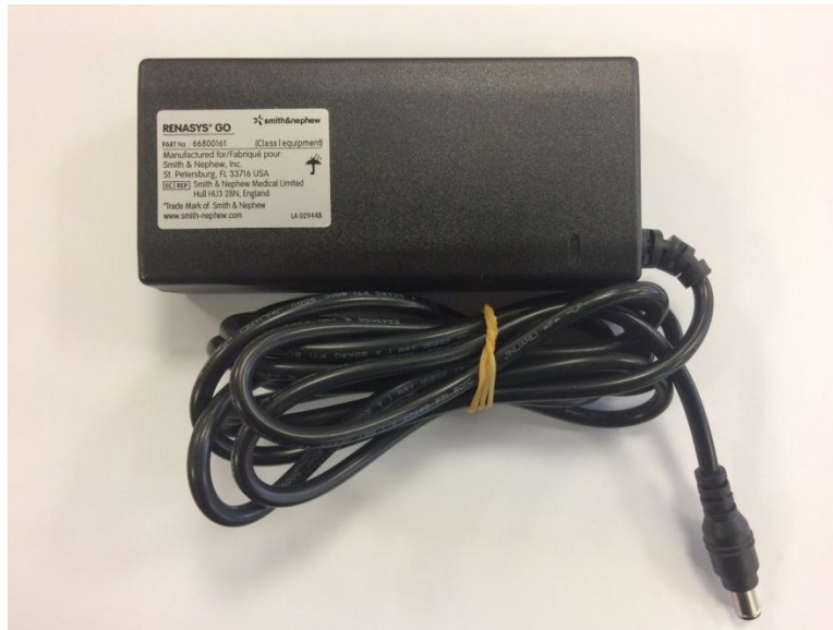
Figure One – The affected External Power Units

The purpose of this Field Safety Notice is to provide information to identify the affected External Power Units and to communicate the necessary actions to be undertaken by customers and distributors.