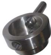
Corrected boss Double securing holes