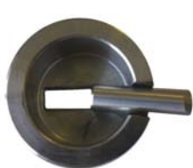
Affected boss pre Jan 2012 Single slotted channel