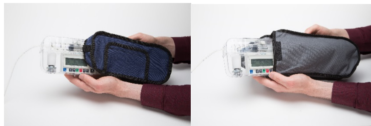
T34 Washable Pouch

CME recommends customers avoid using the pump in sunlight or, if it is necessary for the patient to go outdoors, protect the pump from exposure (for example by placing it in a pocket or a bag). This advice is in line with pharmaceutical manufacturer's advice to protect certain drugs commonly used in end of life care from sunlight during administration. CME syringe pump pouches are available from CME should patients regularly use the device outdoors. This pouch has the added benefits of protecting the syringe pumps from damage and provides straps for securement during transport.