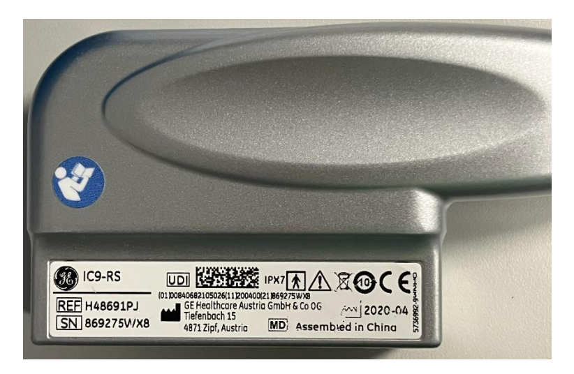
Figure 4. Rating plate example – displaying probe type (IC9-RS) and serial number (SN).

IC9-RS probes with a serial number included in Appendix A are affected by this issue. The serial number (SN) can be found on the rating plate as shown in Figure 4