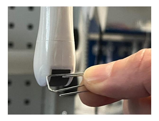
Figure 1: Double image test procedure. Place metal reflector (paperclip shown) at the edge of the field of view. Run reflector along the full curvature of the transducer.

If an additional echo is seen in the sector opposite of the point of contact, the probe is producing a double image artifact. Double image artifacts are only visible towards the edges of the field of view. See test images below from a normal IC9-RS probe (Figure 2) and a malfunctioning IC9-RS probe producing double image artifact (Figure 3).