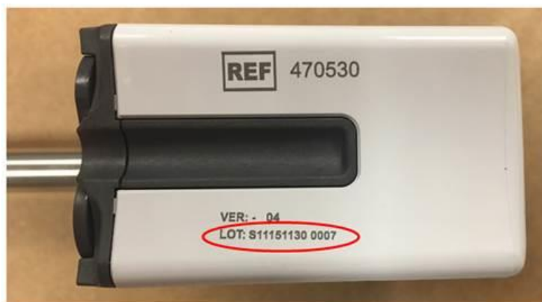
Figure 1: Lot number location on Xi Staplers

NOTE: The lot number of the Xi Stapler 45 and 30 instruments can be found on the instrument housing, Figure 1.