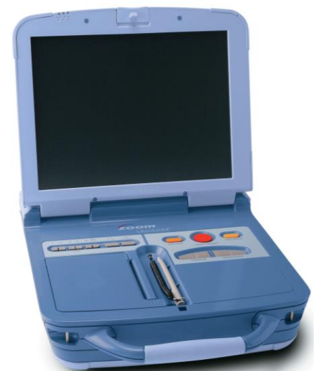
Figure 1. Model 3120 ZOOM Programmer