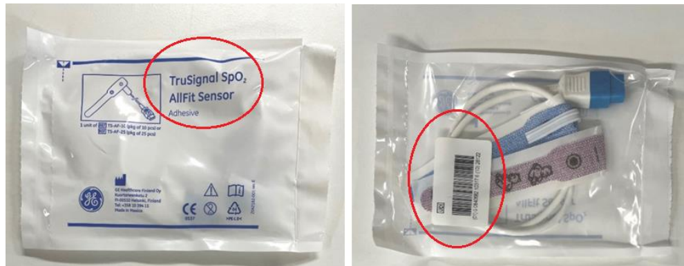
Figure 3: REF/Catalog number, product name & GTIN on Disposable Sensors pouch

For disposable sensors, the product name, model number and GTIN are located on the product packaging as shown in Figure 3.