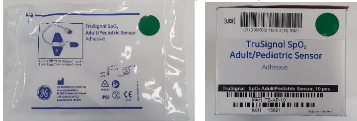
Figure 5: Identification of non-impacted Disposable sensors

In addition to the green circle on their packaging, reusable sensors will also include an additional wrap label with three asterisks (***) next to the GTIN label (See Figure 6). This means that they were inspected by GE HealthCare in manufacturing and are not impacted by the 3 issues in this correction.