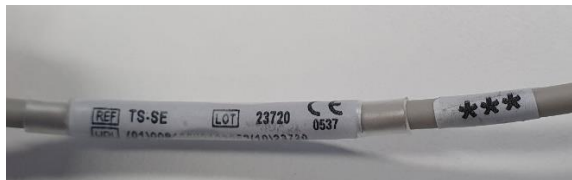
Figure 6: Identification of non-impacted Reusable sensors

INTENDED USE: TruSignal pulse oximetry sensors and interconnect cables are intended for use for continuous non-invasive arterial oxygen saturation (SpO2) and pulse rate monitoring. The devices are indicated for use under guidance of qualified medical personnel only.