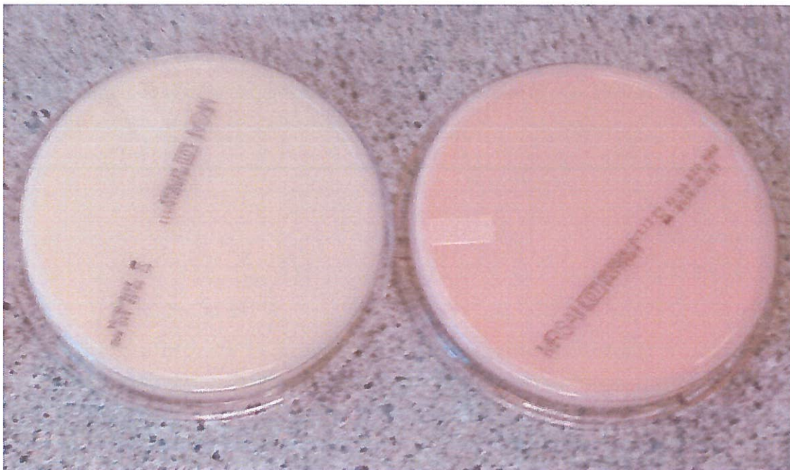
Left: agar with normal color Right: agar with abnormal color, orange-pinkish shade