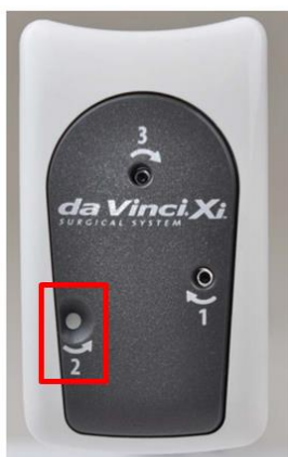
Figure 1: Stapler instrument release hole 2 “closed” with white flag present

In situations where release hole 2 is covered by a white flag (Figure 1) and is not accessible, the SRK tool must be rotated in release holes 1, 2 and 3.