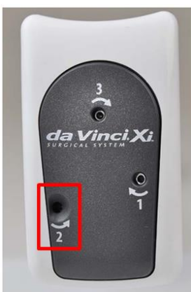
Figure 2: Stapler instrument release hole 2 “open” without white flag

In situations where release hole 2 is not covered by the white flag (Figure 2), rotating the tool in release hole 1 is not required . Attempting to rotate the tool in release hole 1 may result in breaking and rendering the tool unusable.