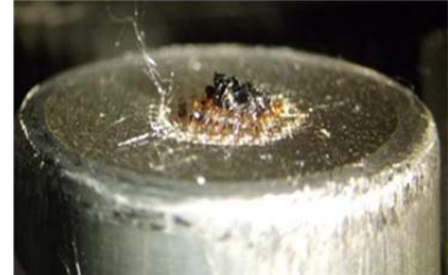
Figure 3: Failed Pad Fibers melted and extruded. Do not use. Replace pad.