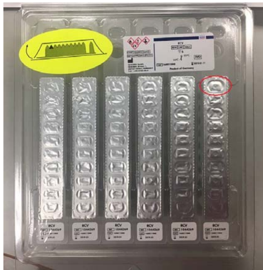
Picture 2: Identification of well 10 in position 6 within the clamshell box (see red circle below)

Non-conforming Reagent Cartridge with missing liquid in well 10