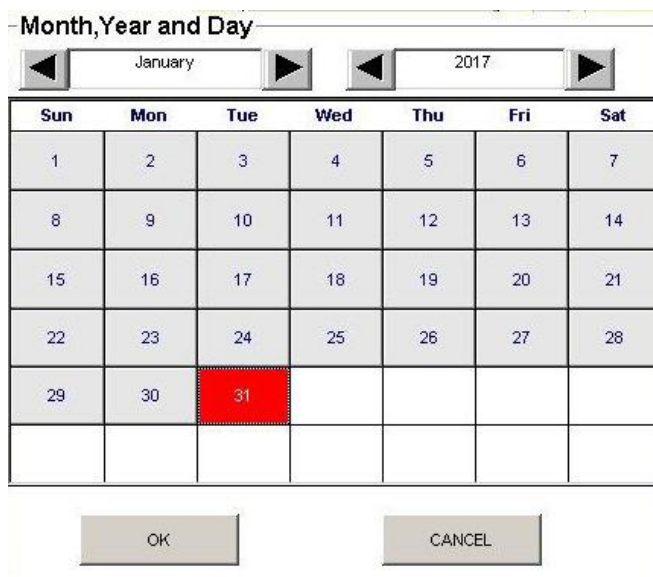
Figure 3. Pop-Up Expiration Date Calendar