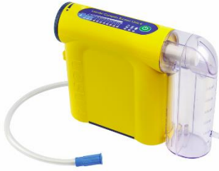
LCSU 4 300 ml (3.3 lbs) canister version

Important Note! This Urgent Safety Notice only applies to Laerdal Compact Suction Units 4 (LCSU 4) manufactured since 1 May 2015.