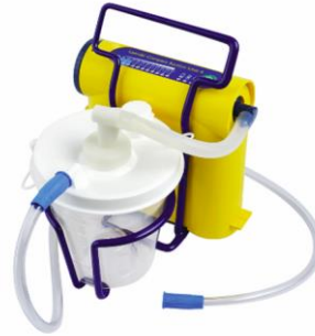
LCSU 4 800 ml (4.3 lbs) canister version