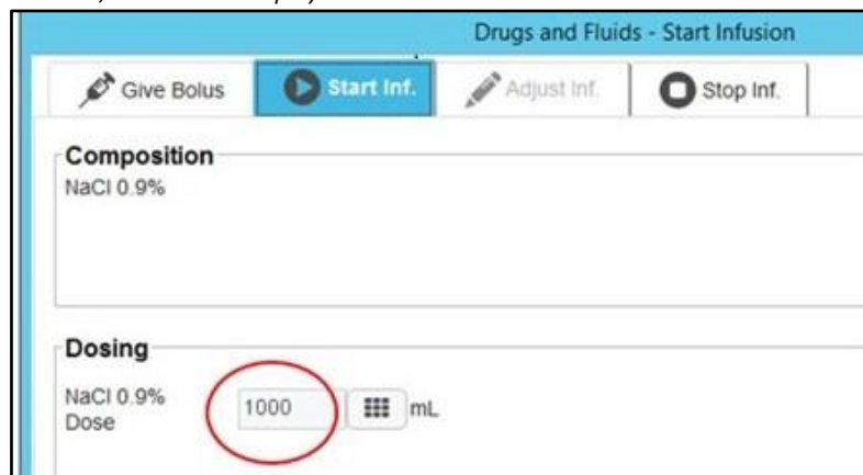
Figure 2: When same infusion is restarted, the dose in the Start Infusion window incorrectly displays 1000 mL; dose should display as 500 ml.

This safety issue has the potential to mislead the care provider, and can result in overdosing or underdosing the patient.