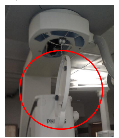
Figure 1: Example of a detached L-arm rotation cover

Philips has identified a potential safety issue with the Philips Allura and Azurion Product Families having monoplane fixed ceiling mounted systems. The ceiling mounted L-arm contains a rotation cover that may potentially be susceptible to falling if a collision between the L-arm and other hospital equipment (i.e., an operating light) were to occur. Although the cover is retained by a safety chain, if a collision were to occur the chain may also detach resulting in the cover falling on the patient, user, or bystander. There have been 5 incidents where minor injuries, such as bruises or scratches, were reported. To date, there have been no reported serious injuries or deaths related to this issue.