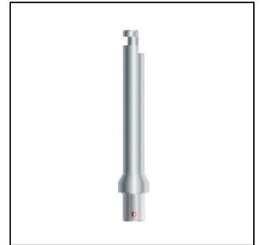
RHD2.5 Hex Driver

The RHD2.5 Hex Driver is used to carry and drive the implant into the osteotomy by connecting to the Fixture Mount/Transfer or directly to the implant. This hex driver is compatible with all 2.5 mm platform sizes of Tapered Screw-Vent®, Trabecular Metal™, SwissPlus®, Tapered SwissPlus®, and Ad-Vent® Implants. Two instruments, RH2.5 and RHL2.5, may be utilized as alternatives to the RHD2.5. Please refer to the respective Surgical Manuals for proper instructions.