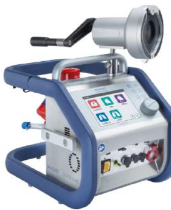
Figure 1: CARDIOHELP with Emergency Drive on top

The CARDIOHELP system is a miniaturized medical perfusion system. Its general function is to drive, to control, to monitor and to protocol the extracorporeal circulation. It acts as a drive unit for a disposable tubing set including at least pump and oxygenator. The CARDIOHELP Emergency Drive (Figure 1) is used in emergencies to manually drive the disposable if the CARDIOHELP-i fails.