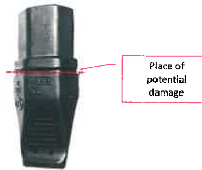
Figure 1 Place of potential damage

We would like to point out that the affected power cords are still fully compliant with the requirements of all applicable electrical and medical device standards.