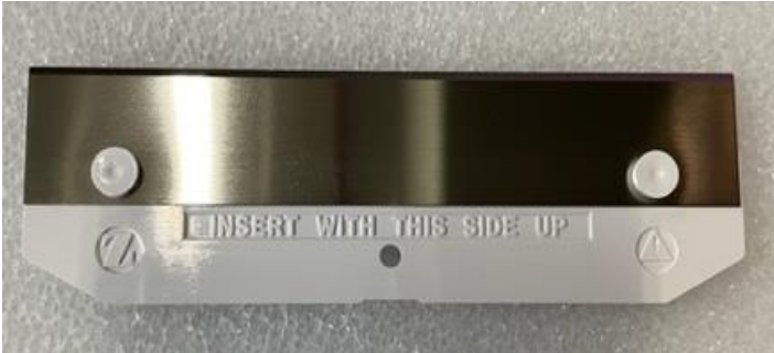
Figure 1 Dermatome Blade

Affected Product: Zimmer® Dermatome Blades (see Attachment 2 for the affected product list)