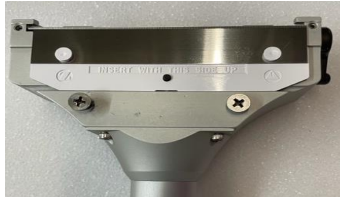
Figure 2 Dermatome Blade assembled in Dermatome Handpiece

Zimmer Surgical, Inc. is conducting a batch/lot specific medical device Field Safety Corrective Action for the Zimmer® Dermatome Blades listed in Attachment 2 – Affected Product List . There have been 38 complaints received related to skin grafts being thin and non-uniform when using the affected blades. The issue would be identified at the time of use and may result in the need for additional harvests to adequately cover the area. The trade-off of incomplete coverage versus having additional grafts is at the discretion of the health care provider based on the condition of the graft, overall patient condition, and severity of the need for the graft.