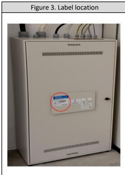
Figure 3. Label location