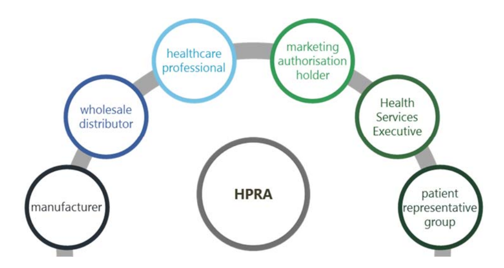
Figure 1: Multi-stakeholder involvement

management of shortages. The sections below outline the roles of different stakeholder groups in the management of shortages.