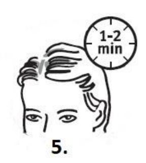
Leave the shampoo on the scalp for a couple of minutes before washing.