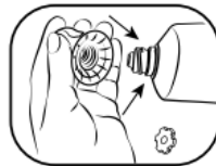
4. Screw the applicator cap back on the tube