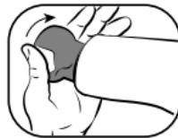
2. Unscrew the applicator cap