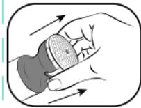
5. Pull white part to open