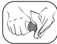
8. Clean the applicator with cotton towel or absorbent paper until visually dry and clean