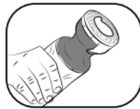
6. Squeeze the tube to release required amount of Emulgel