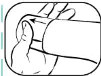
1. Pull off the transparent protective cover