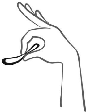
Figure 2 Compress the ring