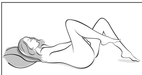
Figure 3 Choose a comfortable position to insert the ring