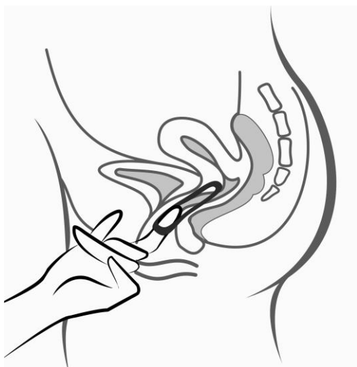
Figure 5: Etonogestrel/Ethinylestradiol can be removed by hooking the index finger under the ring or by grasping the ring between the index and middle finger and pulling it out.

Insert the ring into the vagina with one hand (Figure 4A), if necessary the labia may be spread with the other. Push the ring into the vagina until the ring feels comfortable (Figure 4B). Leave the ring in place for 3 weeks (Figure 4C).