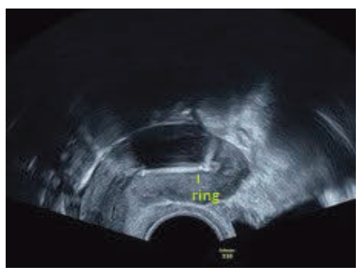
Figure 3 : Kyleena – sagittal plane (2D Imaging)