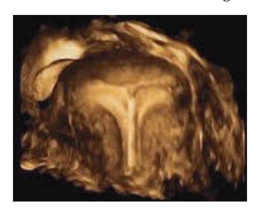
Figure 4: Mirena – coronal plane (3D Imaging)