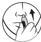
3. Insert in nose