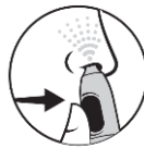
4. Press button