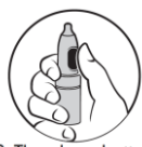
2. Thumb on button