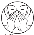
1. Clear nose