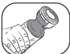
6. Squeeze the tube to release required amount of Emulgel