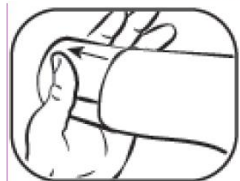
1. Pull off the transparent protective cover