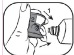
3. Using the key on the applicator cap to remove the star seal on the tube