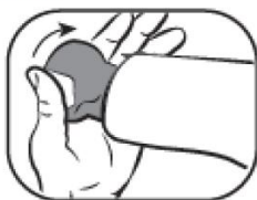
2. Unscrew the applicator cap