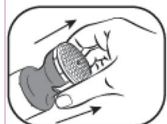
5. Pull white part to open