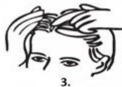
3. Calcipotriol/Betamethasone gel should be applied directly where the raised plaque can be felt and rubbed in on the skin.

Depending on the affected area 1-4 g (up to 1 teaspoon) is normally enough.