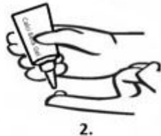
2. A drop of Calcipotriol/Betamethasone should be applied to fingertip.