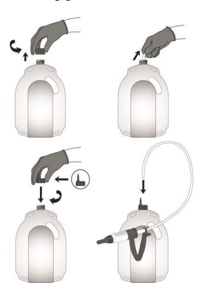
Figure 2 Attaching the recommended dosing gun to the 2.5 and 5 litre containers:

After use, coupling vented caps should be removed and replaced by PP simple cap. Vented caps should be placed for a later use in the cardboard box.