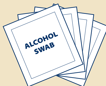
F Alcohol swab packages (x4)