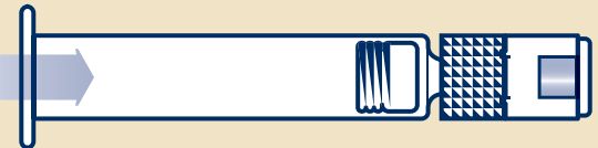
B2 Prefilled sterile water syringe (1)