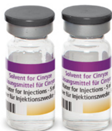
1 or 2 Vials of water for injection, (solvent, 5 ml each)