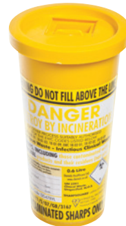
Sharps container (not included in the pack)