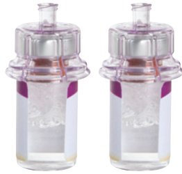
1 or 2 Vials of reconstituted Cinryze