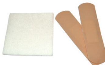
Plasters and dry swabs (not included in the pack)