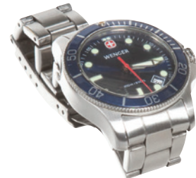
Watch (not included in the pack)