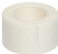
Medical tape (not included in the pack)