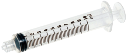
1 Disposable 10 ml syringe