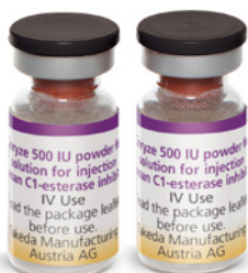
1 or 2 Vials of Cinryze (500 IU each)