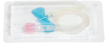
1 Venipuncture set (butterfly needle with tubing)