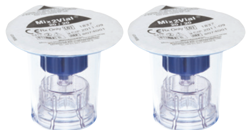
1 or 2 Transfer devices