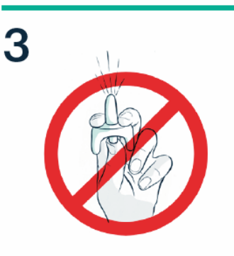
Do not prime or test the nasal spray.

Place the patient on his/ her back. Clear nose and mouth.