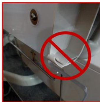
Figure 1C - Broken Latch