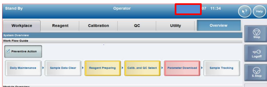
Figure 1: Date (in the red box) not displayed in the Status Line of the User Interface

Please check if the date is displayed in the Status Line of the User Interface at minimum on a daily basis (see Figure 1). Whenever the date is not displayed in the Status Line of the User Interface, the software limitation has occurred on this instrument.