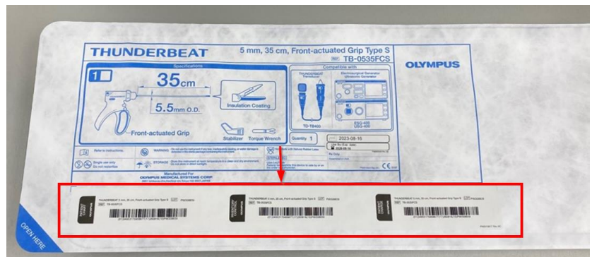
Location of Lot Number on Pouch