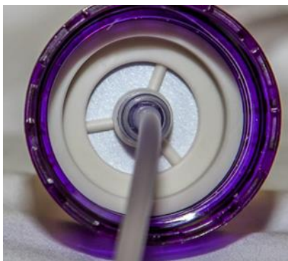
Fig 1 – Image of filter within the cap

We are contacting you urgently to replace any of the unfiltered water bottle caps that you may have with the filtered range. This will be done free of charge. If you are in any doubt, just look at the inside of the water bottle top to see if a filter is present. The below image shows what the filtered cap should look like.