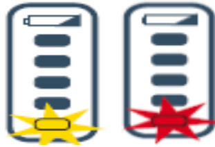
Figure 2: Battery charge display