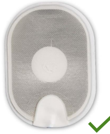
Figure 4: Normal pad.