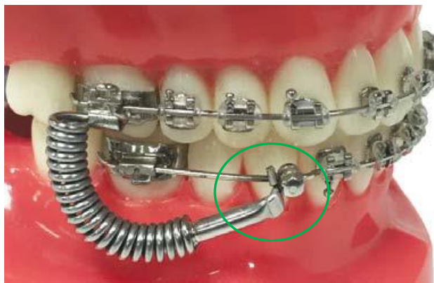
Generation 1 does not have a boot at the Mandibular wire connection.