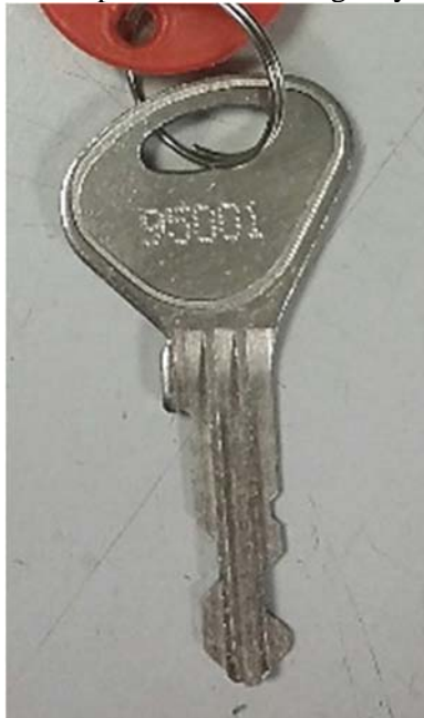
Example 1 - Conforming Key