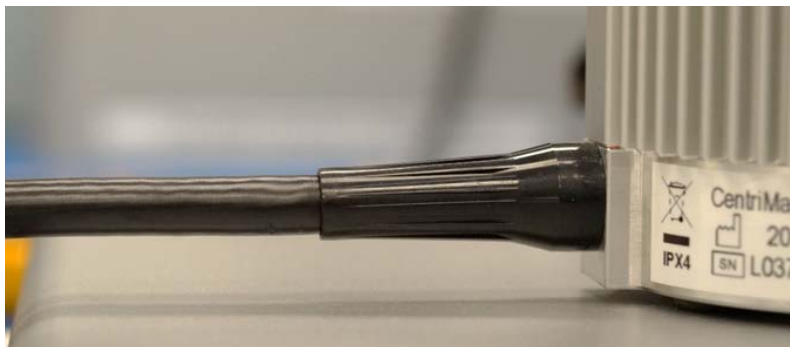
Figure 4: Cable Bend Relief at the Motor