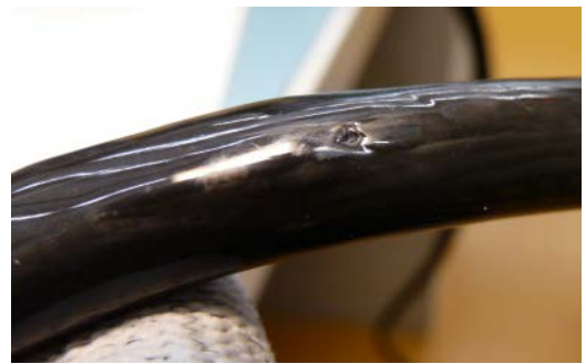
Figure 8: Damaged Motor Cable